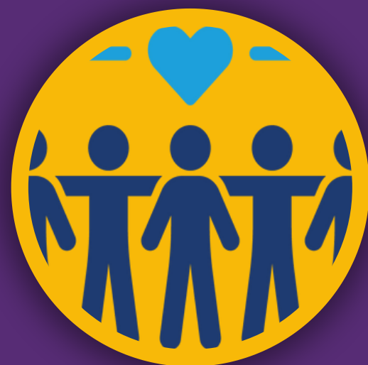
HEALTH & HUMAN SERVICES AGENCIES