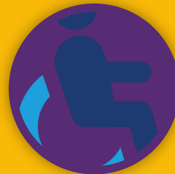
PEOPLE WITH DISABILITIES